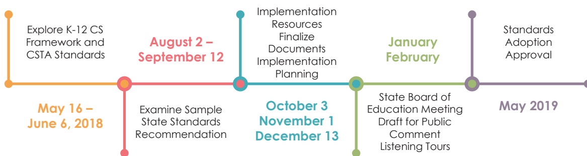
Figure 1. Timeline

The timeline allowed for broad stakeholder involvement and input in the standards adoption process. Public input was also sought during the review period from January 20 to March 6, 2019. The final draft was adopted by the Michigan State Board of Education in May 2019.